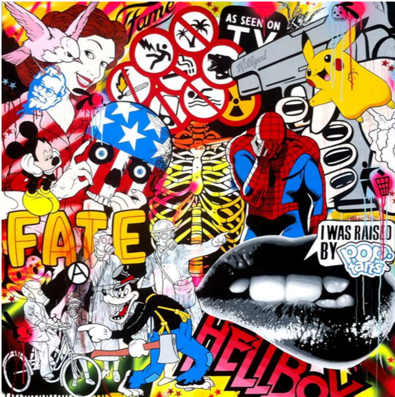
Ben Frost, 2013 know-your-product