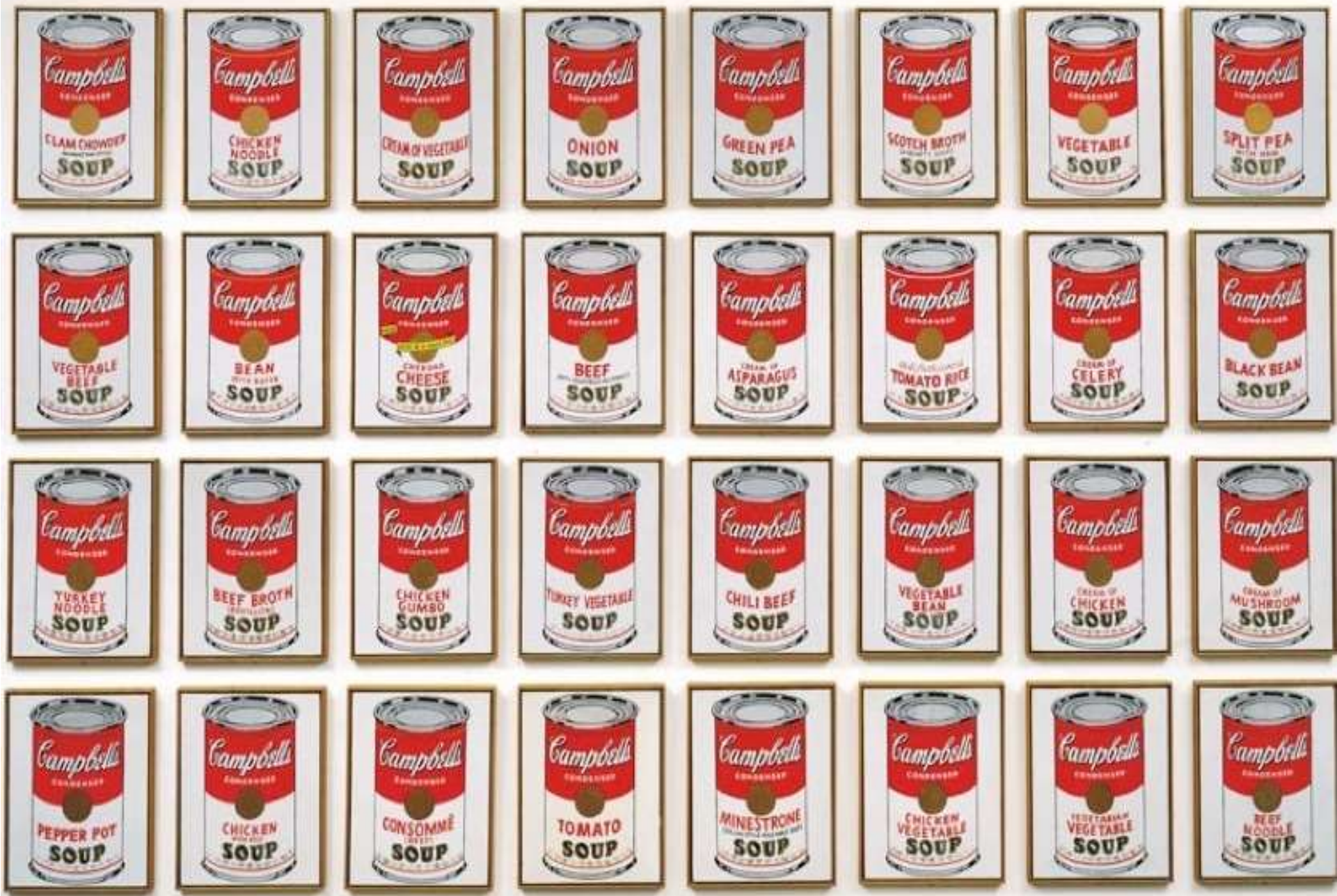
32 Campbell's Soup Cans by Andy Warhol, 1962