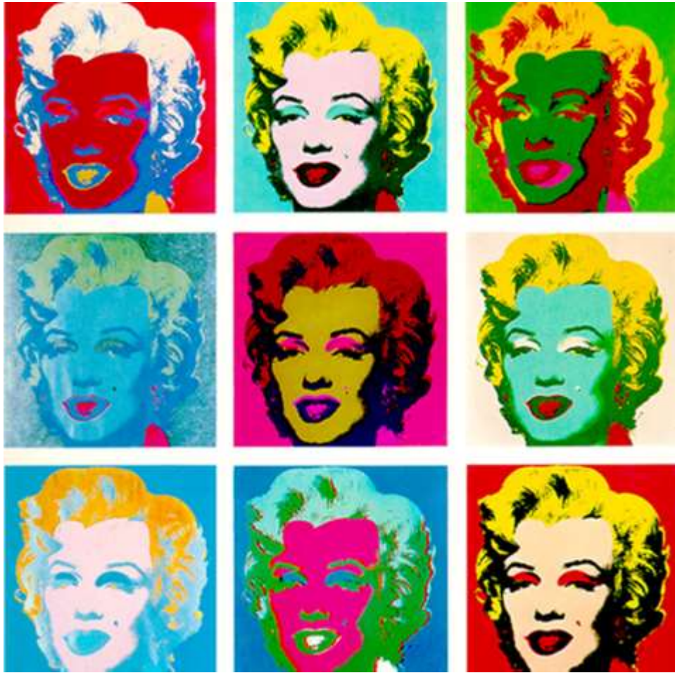
Marilyn Monroe by Andy Warhol, 1962