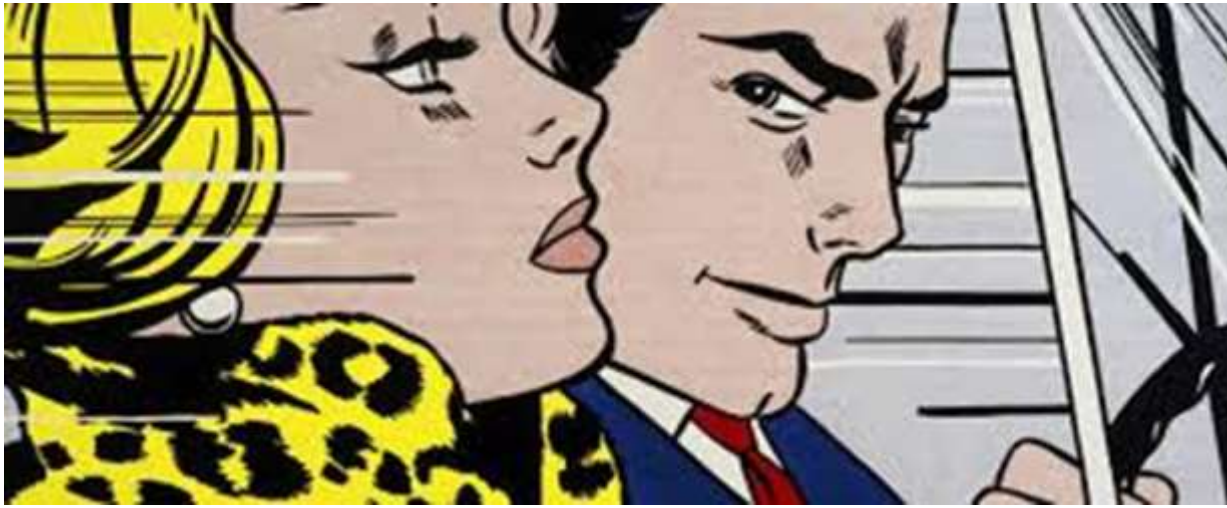
In the Car by Roy Lichtenstein, 1963