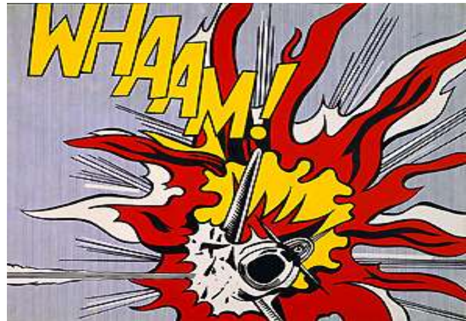
Whaam! (diptych) by Roy Lichtenstein, 1963